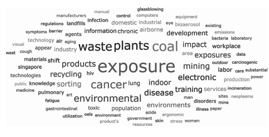
Fig. 2. Distribution of terms found in search A based on their frequency of use in the articles' abstracts.