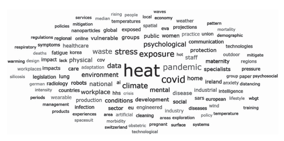
Fig. 3. Distribution of terms found in search B based on their frequency of use in the articles' abstracts.