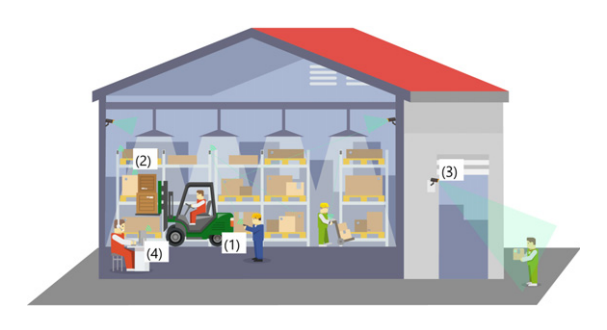
Fig. 3. Exemplary IoT solution.

transmitted. In addition, (4) exemplary software is implemented to which employees have access that receives the data from the IoT devices. The software can be obtained from all computers and laptops in the company network. We carefully developed the intervention by incorporating the IoT characteristics mentioned in Section 2.1: the document scanner, the sensors and the RFID reader represent the physical objects in the working environment enabling an increased level of automation. The software represents the application that makes the received data available to users. The intervention is a comparatively simple and rather low-complexity IoT solution that is appropriate for SME specifications (i.e., low financial and human resources).