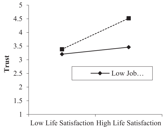
Fig. 2. Moderating role of job embeddedness between life satisfaction and trust climate.

Hypothesis 3 predicted that job embeddedness moderates the association between life satisfaction