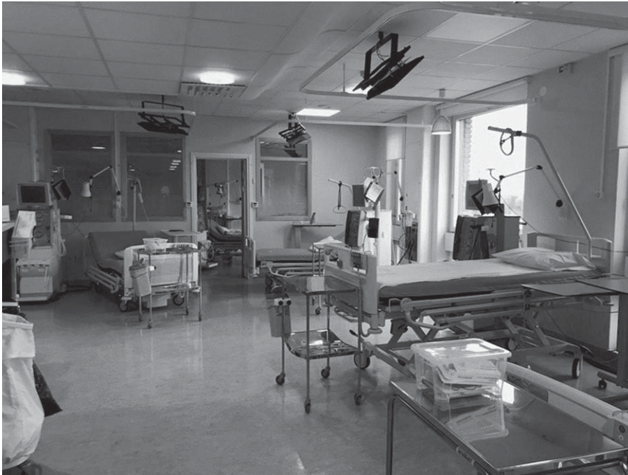
Fig. 1. Physical layout of a haemodialysis room from a Swedish centre.