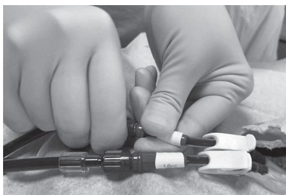
Fig. 3. Connecting the bloodlines to a Central Venous Catheter.