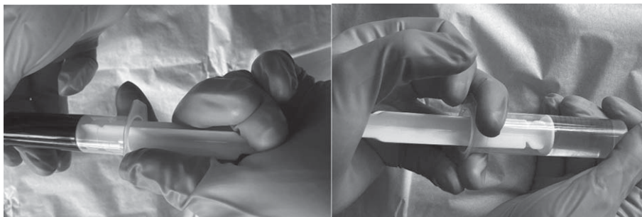
Fig. 2. Reconstruction of the flushing process performed on the central venous catheter before connection to the bloodlines. Blood and heparin are aspirated from the central venous catheter before flushing the lumen multiple times with 0.9% normal saline.