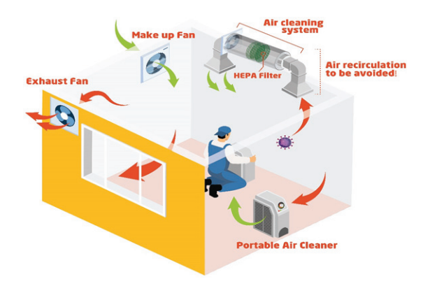
Fig. 2. A schematic view of the proposed engineering controls based on the improvement of ventilation systems.

Portable air cleaners, known as air purifiers, are supplementary systems that can help remove particles from the air with the same efficiency as the ventilation systems. In specific situations where the existence of ventilation cannot be improved, local air cleaning devices could provide more protection against SARS-COV2. The portable air cleaner must have HEPA filters to have a significant role in air cleaning. Electrostatic filtration-based devices with high efficiency in air cleaning could be introduced as a good alternative in situations where air cleaners are not applicable due to limited airflow. During the utilization of electrostatic filtration-based devices, it is better to be located close to the workers' breathing zone to be more efficient. A schematic view of the proposed engineering controls based on improvement of the ventilation systems has been depicted in Fig. 2. Accordingly, collection of air cleaning systems