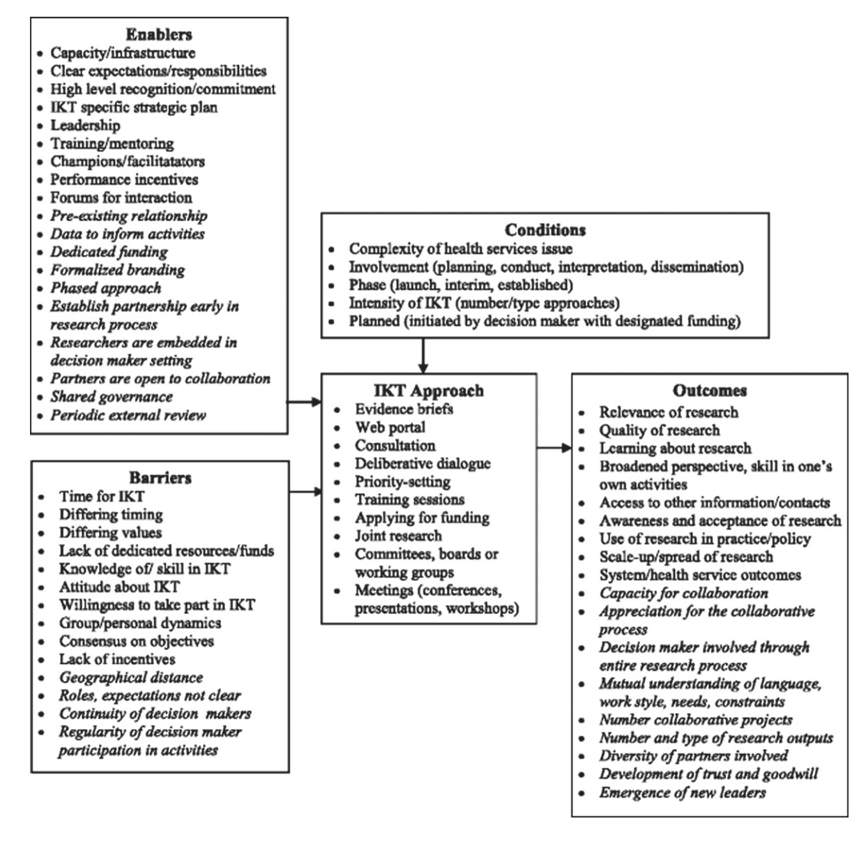
Fig. 2. Summary of iKT approaches, influencing factors and outcomes. Reproduced from Gagliardi et al. [2]. No changes were made. Creative commons license http://creativecommons.org/licenses/by/4.0/.