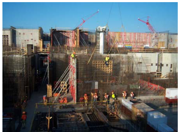
Figure 1. The new facility walls and levels in full construction phase.

In addition to working on model layouts, the Team members preferred to conduct on-site visits to the structure itself while under construction. The experience of being in an actual room helped with special determinations and the future physical control room environment. During outings and meeting times the team often referred to the overall project as the “French Castle” or “French Fortress” due to the massive scale of the building and extreme thickness of the double walls filled with debris surrounding the inner core structure (Figure 1.).