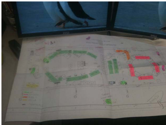
Figure 2. To-scale colored paper for workstation designs.

Herman [7] discusses narrative representatives behavior where, "stories can be used to engage in "problemraising," i.e., to throw into relief ways in which situations and event depart from the typical or the expected. On the other hand, received stories about the world provide a context of typicality in terms of which unexpected occurrences can be interpreted, enabling various modes of problem-solving." Team member (4) finally said, "This is a billion dollar project and we are using tape, colored paper, a ruler, and markers to design a control room for operators to work in for twenty years. This is not normal, is it?" In reality, this is a common way to do design according to conversations with design professionals. The humor was a redeeming quality in an often times depressing and oppressive environment of conceptual design mishaps and constant design changes. Upper management was obsessed with the concrete and construction schedule and was not amenable to necessary design changes, although those changes are inevitable. The team was very professional and strived for perfection in the layout designs.