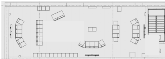
Figure 3: Control Room layout in conceptual design phase.

Janssens and Brett [9] found that managers often set up their teams to fail because they themselves fail to help the team anticipate changes or communicate the changes in a timely fashion. Two of the basic elements of fusion are meaningful participation and coexistence. The team was expected to provide innovative solutions to problems. Figure 3 shows an example of the original conceptual design before the team began the new layout designs. Figure 4 shows the final design after numerous design meetings, outings and discussions.