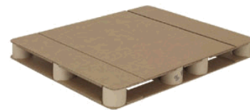
Fig. 2: 3.6 kg Cardboard Pallet (1200mmx1000mm)

The project was implemented initially in Brazil, and then in Argentina, Chile, Bolivia, Paraguay and Uruguay and was well accepted by those customers without any impact on the export operation.