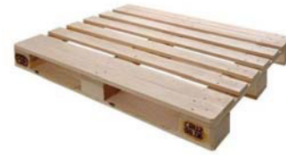
Fig. 1: 25 kg Wooden Pallet

The new pallet has mechanical strength, but is not waterproof. Therefore, the material should not be exposed to rain, and the content of the pallet needs to be wrapped in plastic. There is no limit for the use of the pallet if it is stored under appropriate conditions.