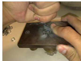
Figure 1: Old Machine – Manual Task

The force required by the employee and the awkward postures were eliminated through the process redesign and change in the way that the employee performs the task.