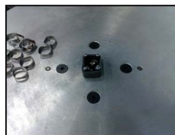
Figure 3: New Machine – After opening the 4-pins

A new EJA assessment was applied. The results: the high risk was totally eliminated, and productivity was increased by 100%. Three old machines were eliminated by the new machine.