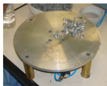
Figure 2: New Machine – semi-automatic