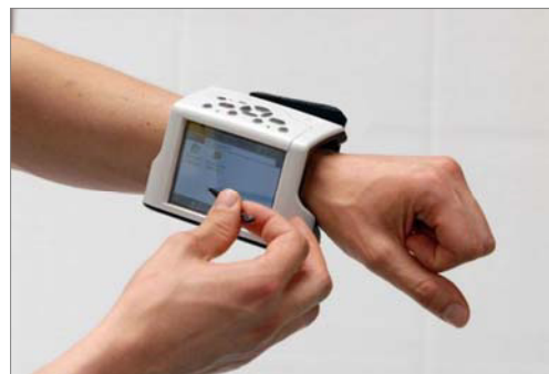
Fig.2. Wearable Computer Integrating Bluetooth, Wi-Fi, GPS

Studies in search of new technologies are being developed, among many projects we can mention wearable computers, appointed by Viseu (2003) apud DONATI (2004) as bodynets, by emphasizing the interaction between body, technology and environment. According DONATI (2004), these products can be considered active agents, by synthesizing contemporary trends such as mobility, continuous information access, personalization, control and networking. In addition to bringing facilities, these devices transform and shape some physical activity and cognitive functions, because it is designed in an integrated manner with the user's movement, inserting themselves in their daily activities. An application of wearable computing that is important for society, it is in the disabled people that will be in possession of cameras, microphones and other sensors to enjoy a relatively normal life like most people. The wardrobe helps especially for home-care services, it relies on studies and research of health related products, such as the development of clothes that monitor blood pressure, heart rate and body temperature, and diagnose users without requiring complex system of wires and electrodes. This monitoring work, mostly via bluetooth, works informing emergency centers through SMS, e-mail or phone, in addition to forming a database of patient history.