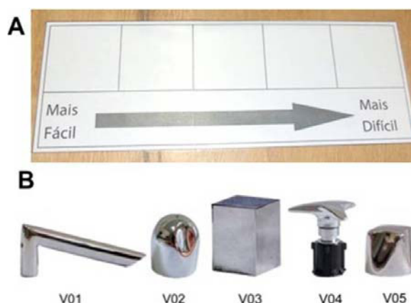
Fig 1 - A: Scale graphics to collect perceptual data (From "easier" to "harder"). B: handles of taps used in the test.

A Free and Clarified Consent Term (TCLE), a recruitment protocol, an identification protocol, and a protocol for perceptual data registration were also applied.