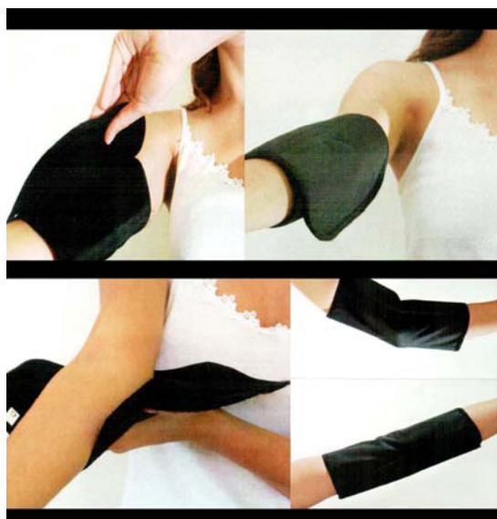
Fig. 2: Use of the ARMflex.

The use of ARMflex® (Fig. 2) is directed to children aged 04 to 12 years for cases of thumb sucking prevention and 04 to 13 years for cases of improperly positioned hand under the face in both sexes. It can be used in patients aged up to 18 years old as an auxiliary correction method.