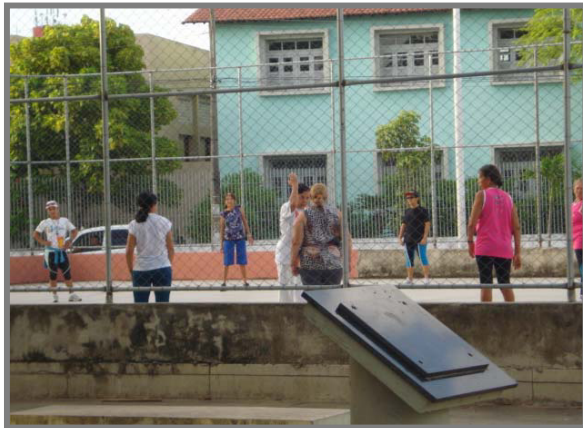
Figure 2. Photo showing a group of people practicing gymnastics, including the elderly.

On the basis of the observations carried out for the production of behaviour maps, the São Gonçalo Square revealed itself to be a place where there is strong interaction between the elderly, encouraging new cycles of friendships, specially within the group formed to practice exercise, proportioning communication between the different generations, as showed in figure 2.