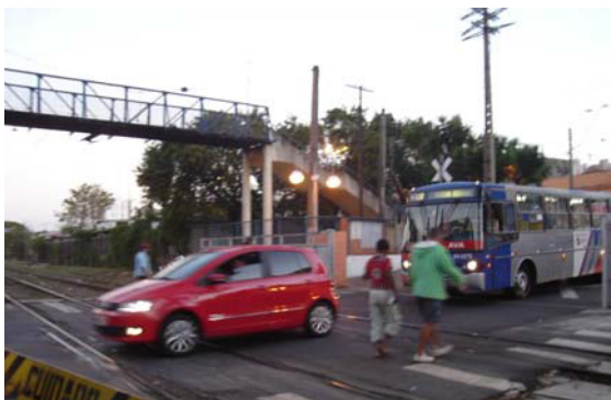
Fig. 4. The dynamics of the Grade Crossing in Americana-SP.

According to the drivers, the work of bus conduction is stressful, the conditions are inadequate and it includes regular practice of extra hours.