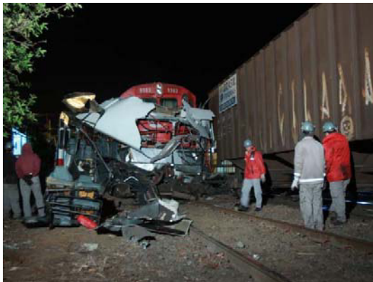
Fig. 3. Picture of the Accident in Americana-SP.

The accident took place at night (Fig. 3), at about 11:25P.M., a few hours before the train was supposed to be withdrawn. On the GC there is heavy traffic of cars, motorcycles, buses and pedestrians (Fig. 4). After two months of the accident, a manual gate was installed to block the traffic of people and vehicles during the crossing of trains on the GC. This gate is closed manually by the watchman who stays on duty upon train operator radio communication, who warns when he's approaching and he's going to cross the GC.