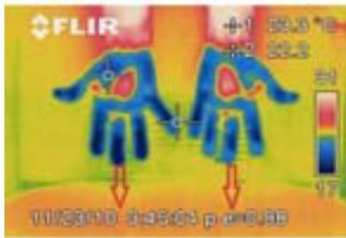
Figure 2 - Thermogram: palmar view