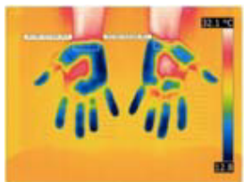
Figure 5 - Wrists regions