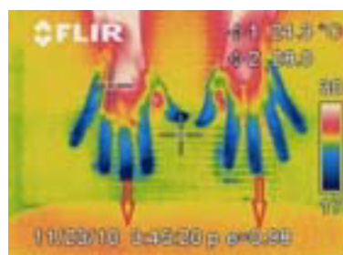
Figure 1 – Thermogram: dorsal view

The thermograph will be positioned one meter high, 90° angle and a distance of 1 meter and 20 centimeters over the region of interest (ROI). The individual will stand with their arms outstretched in front of the body and will make an approach movement toward the feet, fingers outstretched, hands open and away and keeping the middle finger parallel. Will be two thermographic images: view of the dorsal and palmar Figures 1 and 2 respectively.