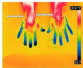
Figure 3 - Dorsal region

The analysis of thermographic images will be performed by the software Quick Report. Bordering a geometric design with the tool "area." This design should cover as much as possible to the dorsal, palmar and fingertip, as shown in Figures 3 to 6.