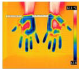
Figure 4 - Palmar region