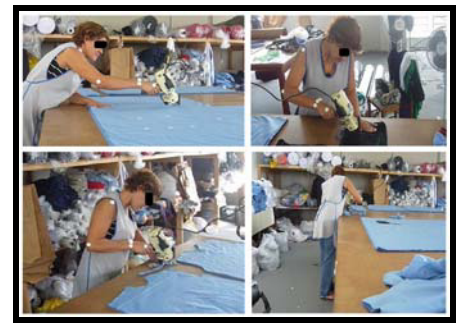
Figure 6: Cut fabric – situations I, II, III and IV