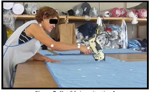
Figure 7: Cut fabric – situation I

The definition of the work situation (FIGURE 7) for analysis and application of the RULA method was based on the stance adopted with the upper limb in extension mostly on the task, considering that the mobilization of the fabric should be avoided so as not to occur during cutting.