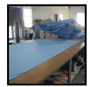
Figure 5: Enfesto of fabric before cutting