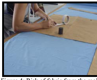
Figure 4: Risk of fabric from the mold