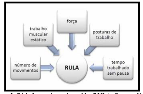
Figure 2: Risk factors investigated by RULA. Source: [16]

In the spreadsheet analysis indicators are presented with diagrams of body postures and three scoring tables can indicate exposure to risk factors [16]. Based on the study of McAtamney and Corlett (1993), the author gives a schematic way the different factors investigated by the method of investigation RULA (FIGURE 2).