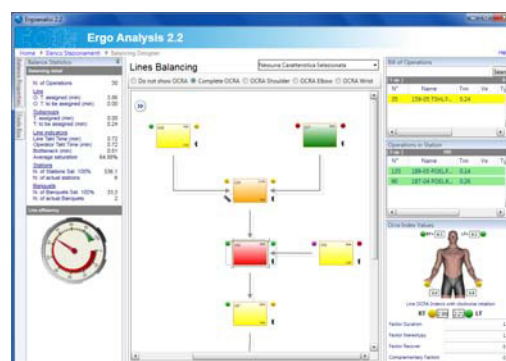
Fig. 3 - ErgoAnalysis: the Line Balancing Tool

Line Balancing is made using a dedicated software interface (Fig. 3), by which the Process Engineer can assign operations to the workstations. Operations can be dragged from the list of the defined Bill of Operations and dropped on the assigned workstation. A number of Economic indicators let the user know details about efficiency of the current Line Balancing. It shows how the production line works, how many time lasts each position, which the maximum time for each position. Typical details are: overall line saturation, number of pieces produced by the line, takt-time, bottleneck.