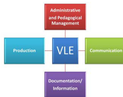
Figure 1. The four categories of a VLE (Source: [15])

Virtual Learning Environments bring together in a single site, several tools that can be used to encourage interaction among all their users. Uzunboylu, Bicen and Cavus [18] present the creation of a VLE that integrates several Web 2.0 tools, such as photos, videos, networks, blogs, profiles, guestbooks and others, thus presenting satisfactory results from students.