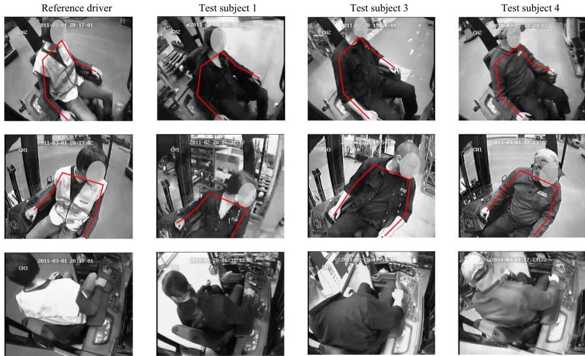
Figure 4 - Cornering situations where rearward observation to the left is required.