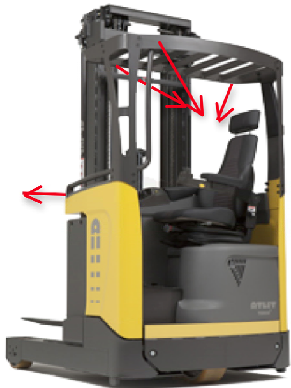
Figure 3 – Placement of the four cameras on the reach truck