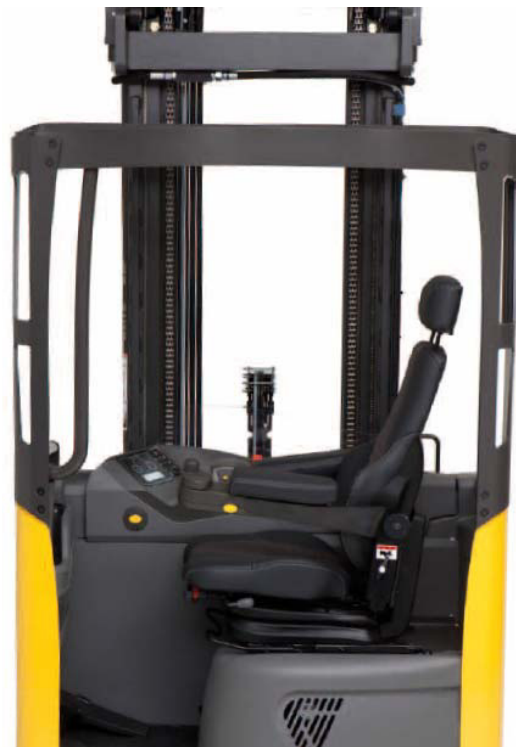
Figure 2 - The reach truck used in this study with a mini steering wheel located on the left armrest.