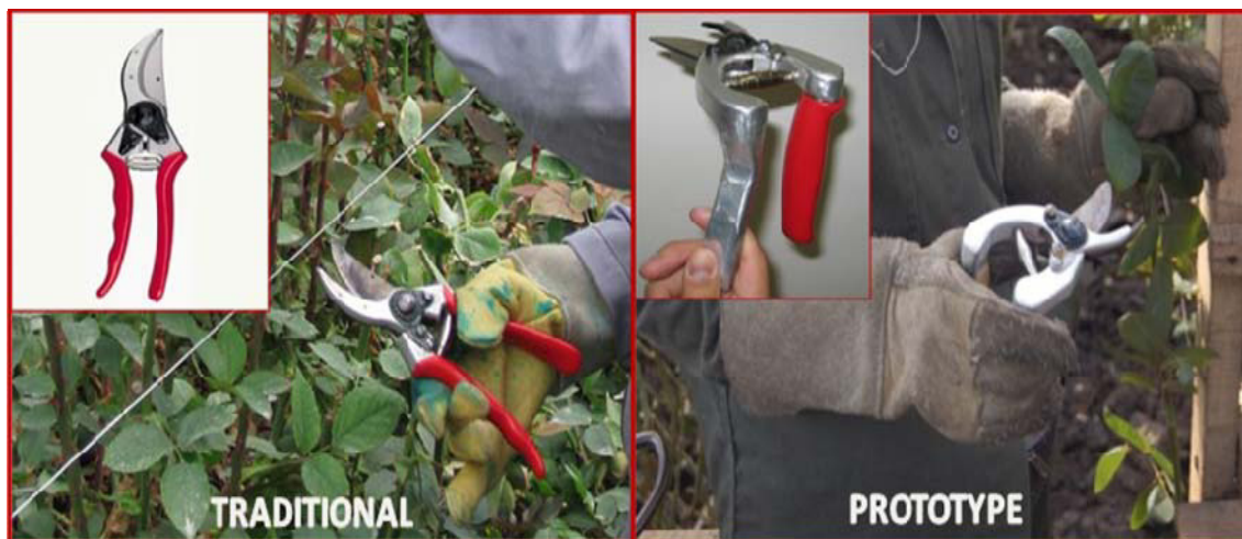
Figure 1. Flower cutting hand tools being compared in the present study

Posture signals were processed analyzed using the DataLINK software (Biometrics, UK). Mean and percentiles 10, 50 and 90 were estimated for each worker and experimental treatment in preparation for statistical analysis. Similarly, muscular activity signals were processed and digitally analyzed using MATLAB. The Amplitude Probability Distribution Function was estimated for the RMS (200 ms moving window) normalized EMG signal for each worker and experimental treatment. Statistical analyses were executed in SPSS 11.0. Interaction and main effects of pruner and working height on the exposure variables of interest were tested using univariate lineal repeated measure analyses with a compound symmetry co-variance matrix.