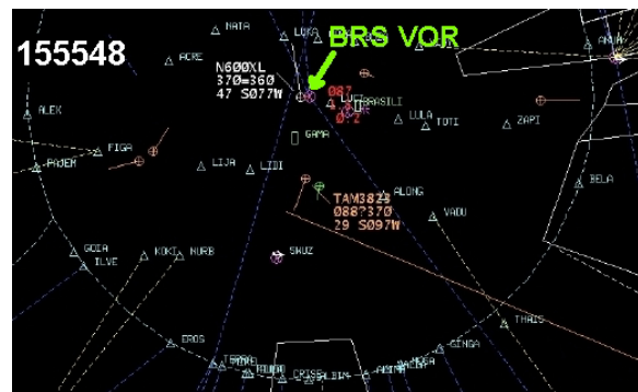
Fig. 1 N600XL data block over BRS VOR.

In Figure 1, the N600XL data block indicates 370=360 when the aircraft flew over BRS VOR. It means that FL370 is the current altitude, informed by the aircraft transponder operating in Mode C, the = signal indicates aircraft stabilized (nor climbing or descending), and FL 360 is the level requested for next segment of the route that started at BRS VOR. The indication 370=360, meaning that there was an aircraft about to fly or flying at a flight level that was different from the flight level requested in the active flight plan, remained for seven minutes in the display, and during this period there were no calls to or from the N600XL. The “=” signal means that the aircraft was leveled. The left field changed from the cleared or authorized flight level, i.e., from the FL370 in the previous sector to the requested flight level – in the active flight plan – to FL360 in the next route segment, i.e., in sector 7. This change is done by the radar console automatically and it is attached to the aircraft active flight plan. The active flight plan can be different from the current flight plan when the necessary ATC instructions is applied to the aircrafts for the sake of better and safe separation from other aircrafts. The software in this particularly radar console does not provide any aural or visual warnings to the air traffic controller when the automatic changes