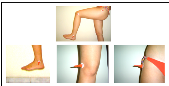
Figure 3: Body marked by landmarks with elements of distinction – Lower Limbs

It was used as reference marker, children's toys in the form of "rocket". Made of plastic and available in several colors.