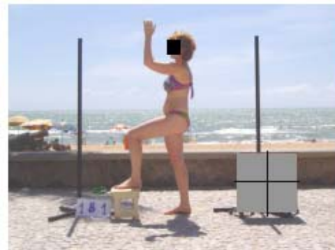
Figure 5: Example of digital photographs collected during the field study - Sagittal Plane.

In the final phase of this step, the data were saved to disk and passed to a new measurement, using a new photo. At the end of the survey, all cataloged data were exported to other software (Microsoft Excel 97), where it possible to carry out statistical analysis charts.