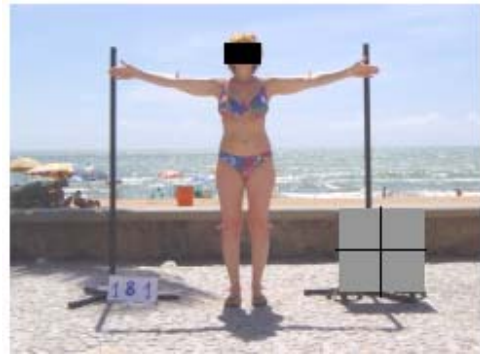
Figure 4: Example of digital photographs collected during the field study - Frontal Plane.

Therefore, we present in Figures 4 and 5 an example of digital photographs taken during the field study, exposing both the positions taken and photographed body plans, such as support materials used.