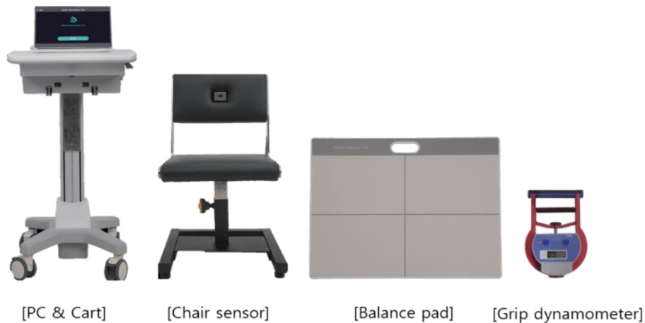
Fig. 1. The hardware configuration of sarcopenia assessment system.

326 FSR sensors were used, and the sensor's accuracy was 10 \text{ kg} \pm 10\% . In addition, blue and red LEDs were used to show the position of the soles of the feet when evaluating according to three conditions (two-legged standing, half-row standing, and standing in line). The balance assessment measures the amount of body agitation for 10 seconds under three conditions.