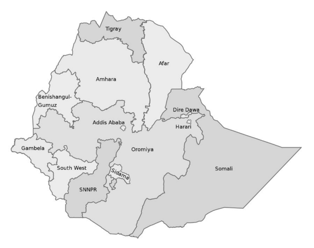
Fig. 1. Regions of Ethiopia (as of 2021).

638 G. Carbonetti et al. / Towards the 4<sup>th</sup> population census in Ethiopia: Some insights into the feasibility of the Post-Enumeration Survey