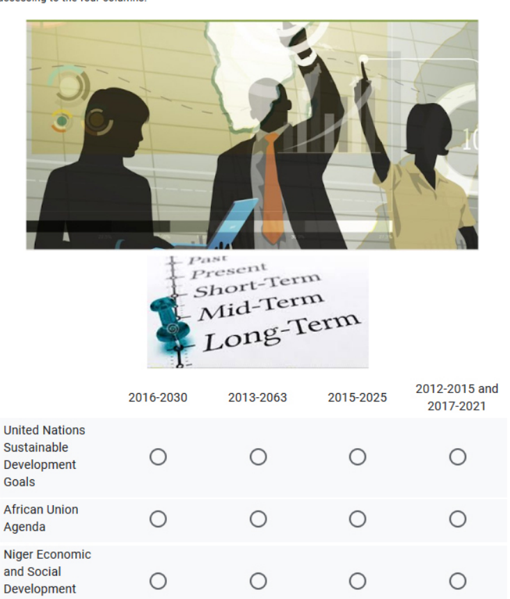
Fig. 3. A question from a data literacy tool proposed as part of the first edition of the ReSAKSS Data Challenge.

For your guidance, a response validation (pink warning) has been activated for this question. Don't be afraid, it will disapear after selecting only one response per line and column. When taking the quiz via some mobile devices it is possible that you need to use the screen cursor for accessing to the four columns.