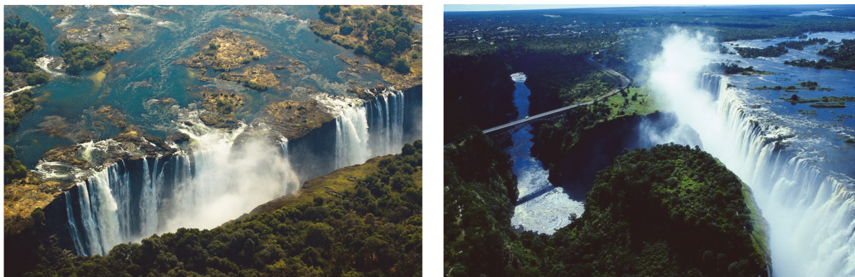
Fig. 1. Two views of Victoria Falls – Musi-o-Tunya.

choice at this point either to go to college or start working. The representative of the Zambia Central Statistical Office assured me that office also provided education opportunities. Being the first-born child, I opted to work and later go to school – although at the time my intention was to study accounting – a dream that was never fulfilled.