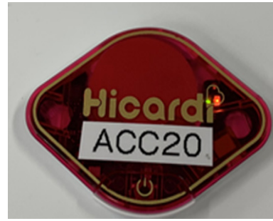
Fig. 2. The PostureRite DPI.

The participant was positioned sitting on a supported chair. The targeted skin area was prepared by