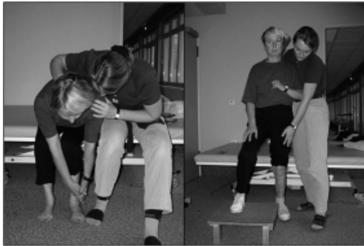
Fig. 2. Left hemiparetic stroke patient practising gait preparatory manoeuvres supported by a physiotherapist.

body weight so that subjects can carry their remaining body weight adequately, i.e. without knee collapse or excessive hip flexion during single stance phase on the affected leg.