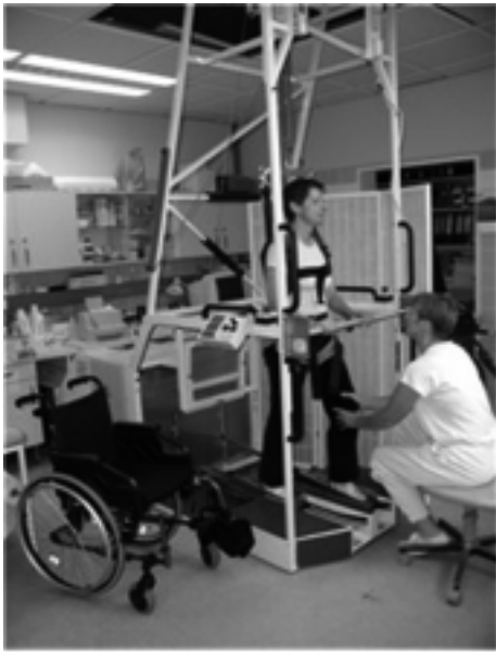
Fig. 4. Left hemiparetic stroke patient practising gait on the Gait Trainer GTI with partial body weight support assisted by one therapist.

Kosak and Reding conducted the first randomized study in 56 acute stroke patients who needed at least moderate assistance for walking [22]. The experimental group received treadmill therapy with PBWSTT following the above-mentioned principles. The control treatment consisted of aggressive early therapist-assisted ambulation using knee-ankle combination bracing and hemi-bar if needed, i.e. it did not follow conventional treatment concepts but stressed gait practice. Treatment sessions of up to 45 min per day, five days a week were given as tolerated for the duration of inpatient stay or until the patients could walk over-ground unassisted. The outcome of the two groups as a whole did not differ. However, a subgroup with major hemispheric stroke (defined by the presence of hemiparesis, hemianopic visual deficit, and hemihypesthesia) who received more than 12 treatment sessions showed significantly better over-ground endurance and speed scores favoring PBWSTT. The authors concluded that both approaches were equally effective except for a subset of severely disabled patients who were difficult to mobilize using physiotherapy alone.