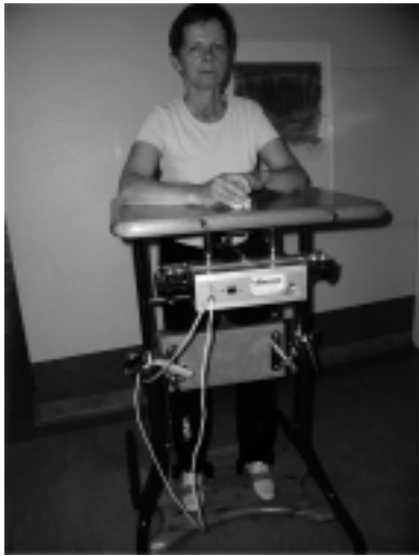
Fig. 1. Left hemiparetic stroke patient practising stance with the help of a standing frame.

The early mobilization is an integral part of the positively evaluated concept of stroke units [25] consisting of a multidisciplinary rehabilitation approach.