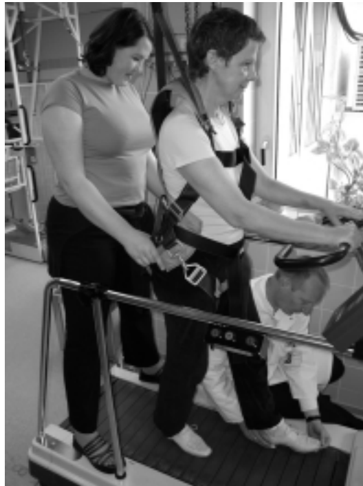
Fig. 3. Treadmill training with partial body weight support of a left hemiparetic stroke patient, assisted by two therapists.

son and Sunnerhagen compared oxygen consumption during treadmill walking with 30% BWS and without BWS in stroke patients. The 30% BWS condition required less oxygen consumption than full weight bearing. The authors concluded that patients with cardiovascular problems could tolerate treadmill therapy with BWS [6].