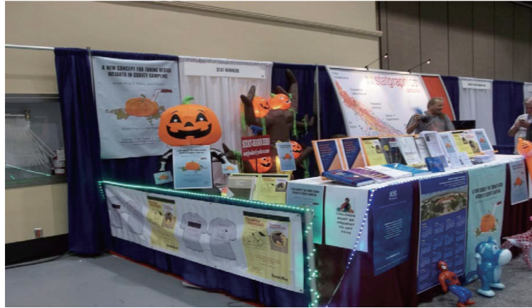
Fig. 2. Booth appearance from the left side corner.

The booth was decorated by blinking LED lights on the front and left side, as seen in Fig. 2.