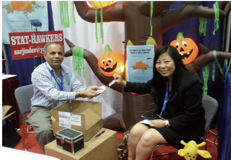
Fig. 8. Randomized response survey.

Unfortunately for these responses the crossed model did not work, which allowed us to make an improvement to the crossed model proposed by Lee et al. [1]. We applied a square root transformation on the observed proportions \hat{\theta}_{ij} , i, j = 1, 2 , because under such transformation, one may easily write: