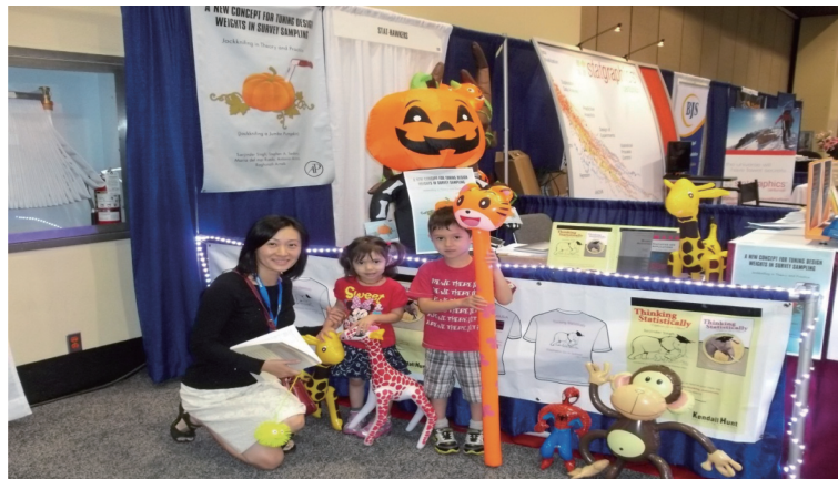
Fig. 5. Children with toys.