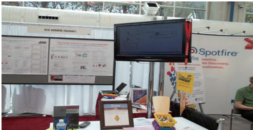
Picture 4. TV and chocolate truck at the booth STAT-HAWKERS.