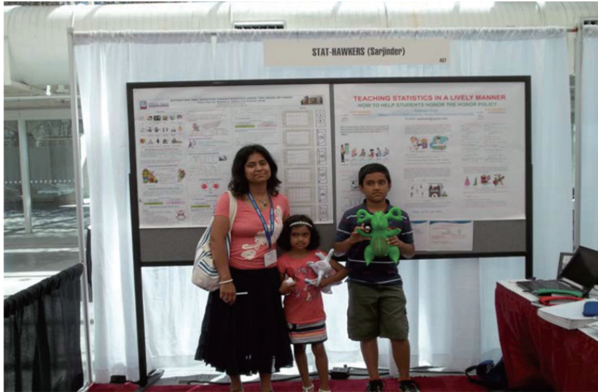
Picture 3. An attendee with kids taking elephants at the booth STAT-HAWKERS at San Diego, CA.