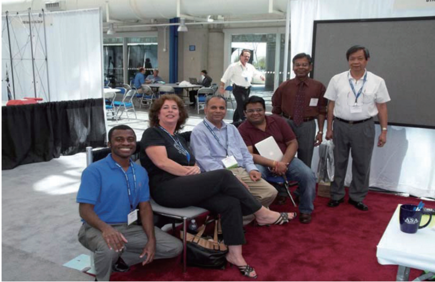
Picture 5. Friends came to say good bye while closing the booth at San Diego, CA, in the last day of JSM' 12.