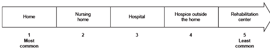
Fig. 2. Ranked end-of-life settings for patients with sIBM, based on the experience of 13 physicians from seven countries. Each physician was asked to score the end-of-life settings shown above (1 = most common, 5 = least common). Based on all the physicians' responses, the mean score was calculated and used to rank the settings. sIBM, sporadic inclusion body myositis.