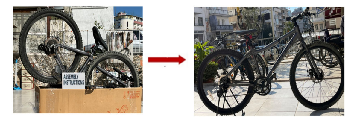
Fig. 4. The written instructions that come with an unassembled item in a box cannot put the parts together and assemble it. Assembly requires an agent with the ability to read the instructions, interpret them, and implement them.

As stated above, information is often presented as a knowledgeable, purposive, and powerful agent. But information is not an active agent or an engineer, and it cannot organize a physical system. Therefore, information does not have causal power. A boxed item such as a bookcase or a bicycle that we order comes complete with detailed instructions on how to assemble it. But those instructions cannot put together the parts and assemble the bookcase or the bicycle. They just can't. Written instructions have all the information needed to assemble the parts. But in the end, printed instructions are merely inept ink-tainted paper. Behind an assembled bookcase or bicycle, there is an agent that can read the instructions, make sense of them, and has the skill and power to move the parts into their rightful places (Fig. 4).