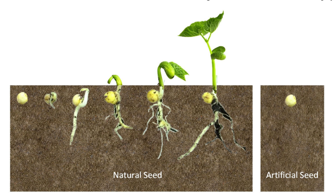
Fig. 2. A natural plant seed buried in moist soil germinates and sprouts, while the artificial replica of it does not.

When a natural seed is sown, it germinates, grows roots, takes in the right materials, builds a trunk and branches, weaves leaves, and constructs fruits, as shown in Fig. 2. An artificial seed of exact physical