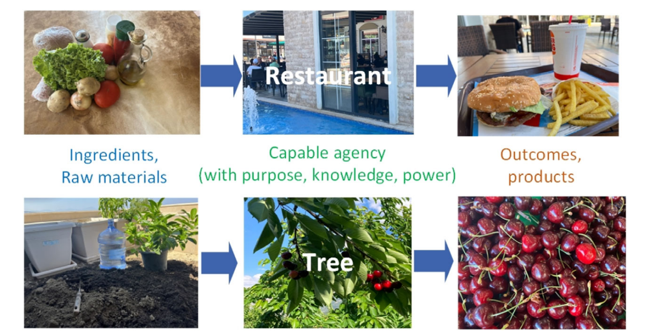
Fig. 3. The restaurant – fruit tree analogy: both the restaurant and the fruit tree involve an agency with purpose, knowledge, skill, and power; tangible in the former but intangible in the latter.

DNA is merely a chemical molecule and it does not qualify as an active agent. The DNA cannot even know what those inept symbols of information in its structure are, let alone read, understand and execute the indicated instructions. If the potatoes in a house are turned into fries, then there must be an active agent (a cook in this case) in the house with purpose, knowledge, skill, and power.