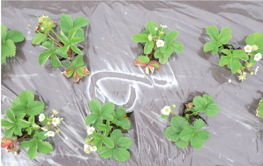
Fig. 3. Open field flowering in 2013 of 'Sonata' bare root A15 plants in Mid-Norway.