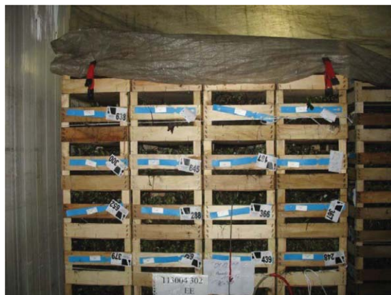
Fig. 2. Commercial CATT treatment of strawberry mother planting stock in equipped rooms. December 2011.

two commercial companies (Ruvoma, Montfoort NL and Van Acht Cooling, Sint-Oedenrode NL) who provide the CATT protocol as a phytosanitary treatment of strawberry runners (Fig. 2). At a smaller scale the standard and new CATT method was also applied in the experimental equipment of Food & Biobased Research (FBR). During CATT treatment temperatures were recorded at several places. After treatment during 24–26 April and a short storage period, small samples of 20 plants each including untreated were transplanted in the field at Vredepeel NL on May 8, 2012. From 4 weeks after planting the field plots were assessed on plant establishment, plant loss and initial formation of runners in a 2 weekly interval until the end of July 2012.