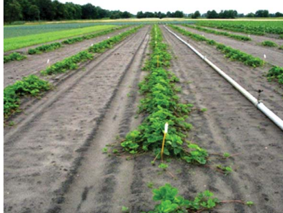
Fig. 4. CATT field trial 2012, planting date May 8. Row in middle foreground according adapted or new CATT, far left untreated, 2nd row from left according standard or old CATT. Vredepeel NL, July 31 2012.

too tight in the box during treatment. Also sufficient humidification and control of the proper oxygen concentration is important.