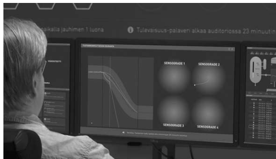
Fig. 5. Production change.