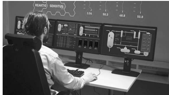
Fig. 2. Production monitoring.

As a storyline, the SFP video “A remote operator’s day in a future control center in 2025” has been built from six scenes that take place during an operator’s work shift. The live action scenes and voice-over explanations deliberately aimed to be provocative in order to stimulate discussion between the participants. In what follows, there is a brief explanation of each