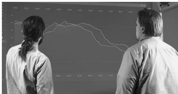
Fig. 3. Guidance.