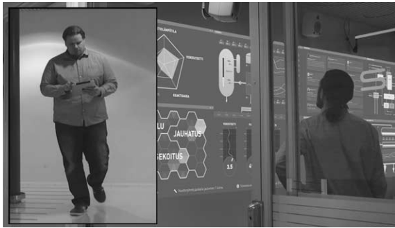
Fig. 7. Shift change.

bleshooting actions are automatically stored by the system so that they can be of use should the same situation arise in the future.