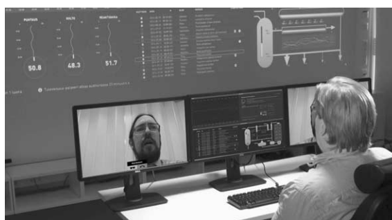
Fig. 6. Disturbance management.