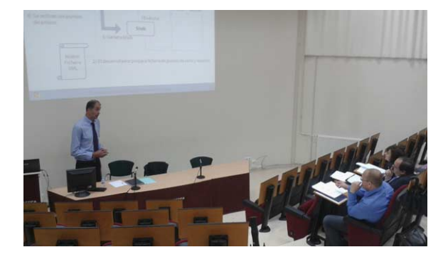
Fig. 1. PhD dissertation defense.

The main publications associated with this PhD thesis are [2–5]. The full text of the thesis is available on the Publication Open Repository of the University of Oviedo [1]. The source code of the platform developed, together with the context-aware example applications, and all the benchmarks used in the evaluation of the platform are also available for download.<sup>1</sup>