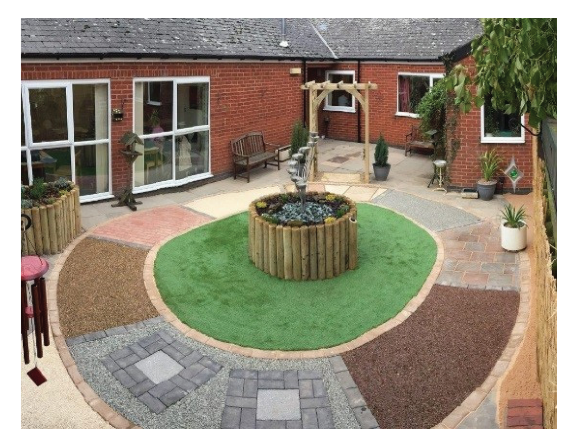
Fig. 5. A looped pathway design in an outdoor garden.

dementia) states that persons living with dementia have the right to the full range of healthcare, including diagnosis, treatment, rehabilitation, health promotion, disease prevention, risk reduction, social support, and palliative care (United Nations, Committee on the Rights of Persons with Disabilities, 2017) [34]. If we look at this statement as written, we can argue that placement of PWD into institutional LTC facilities with 24-h staffing and access to food, medication, and shelter covers the basic needs under the UN Convention. COVID-19, however, laid bare the inadequacies of many care models the world over, especially as it relates to disease prevention, risk reduction, and social support.