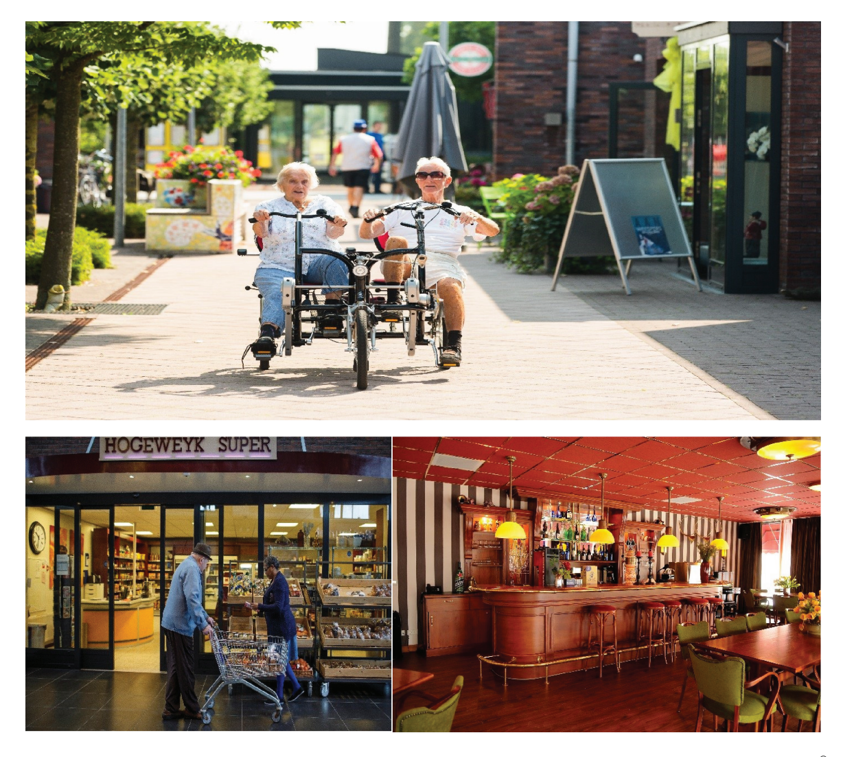
Fig. 1. A day in the life of the De Hogeweyk Dementia Village in Weesp, The Netherlands.

anxiety. The four most recent lifestyles assigned to the residents include Urban, Traditional, Cosmopolitan, and Formal [82, 84]. This model of care has won multiple awards for innovation and design and stands as a role model for other countries. There have been some ethical arguments against this model including the use of "deception" and the creation of a false reality, as well as stigma and separation of residents from the real world [85]. The "Dementia Village" concept has been replicated to some degree in Denmark (Bryghust-Svendborg Dementia Town; 2015), Switzerland (Weidlisbach; 2017), Ireland, Germany, France, New Zealand, Australia, and Canada (Comox, Langley, and Vancouver in British Columbia; Saskatoon in Saskatchewan) [85, 86]. In