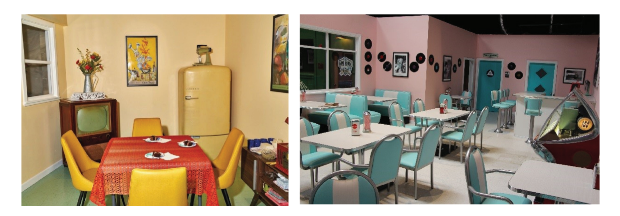
Fig. 2. Glenner Town Square: A typical dining room at home and Rosie's Diner.