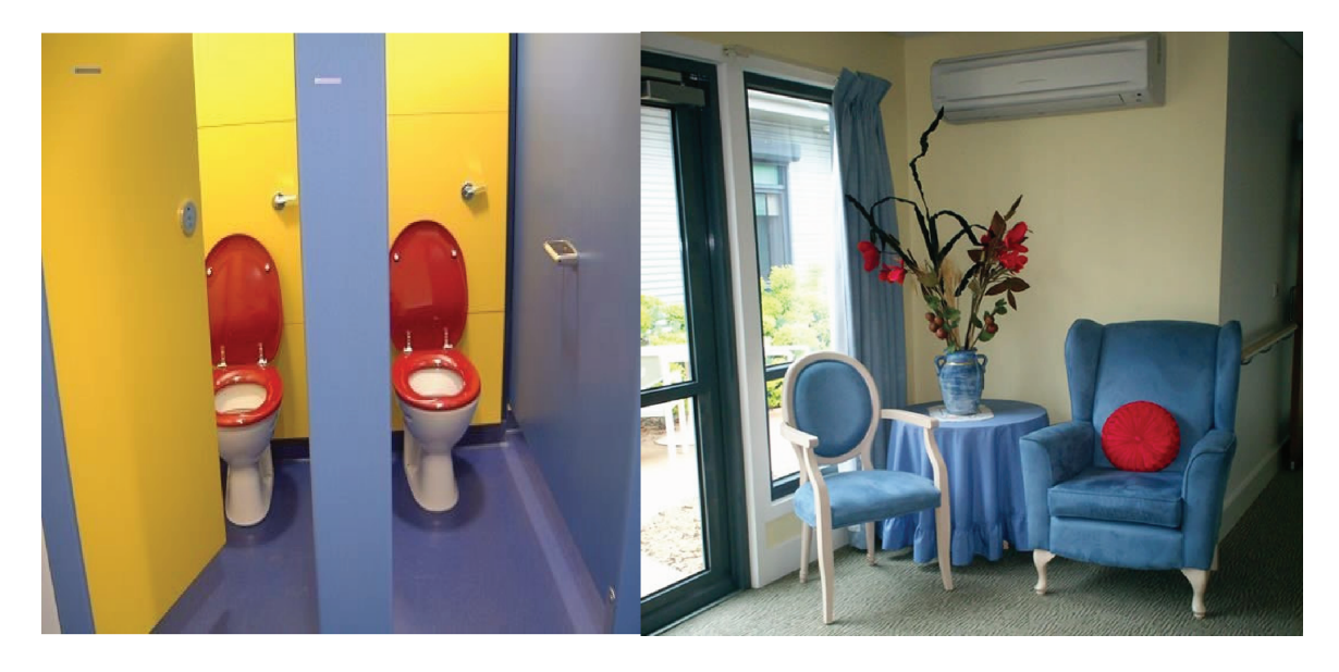
Fig. 3. An example of color contrast for a toilet seat and the use of natural lighting and color contrast to define a space. Reprinted from Google Free Images.

cues [114–116]. The lightness of the color (tint and shade) can impact the ability to recognize a color [114]. Design elements that can improve color contrast and wayfinding and reduce falls and confusion include painting of doors, light switches and wall mounted fittings a different color from the background, avoidance of very dark or pastel colors, use of non-glossy matte finishes, simple solid floor patterns and colors with no black lines, swirls or circles which could be confused for holes or water, and a clear delineation between objects (e.g., toilets, furniture, grabrails, dining plates, shelves, cupboards) and their surroundings [10, 39, 68, 110]. Colors with a Light Reflective Value (LRV) of >65% should be used on all surfaces. LRV measures the percentage of light a paint color reflects, and high LRV paint will "bounce" daylight deeper into spaces improving orientation and visual acuity for residents [39].