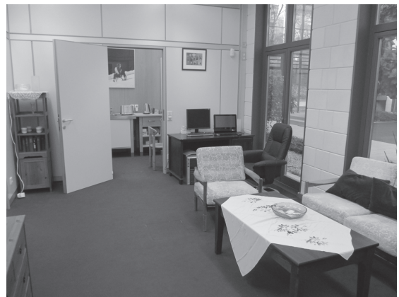
Fig. 2. Living-room and kitchen of the smart home.