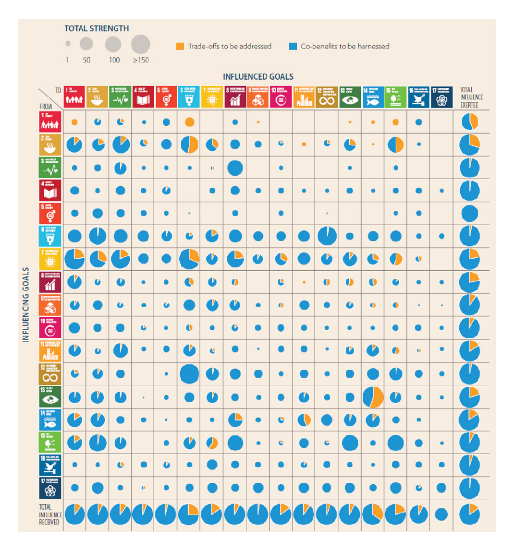
Fig 1. This figure from the GSDR2019 shows the interlinkages between the sustainable development goals based on existing scientific literature. The size of the circle shows the volume of studies to which the analysis bases for each interlinkage, on global interlinkages. The co-benefits are shown in blue while the trade-offs are indicated with orange color. See the report for more details on the methodology.

due to their linkages to each other and to all sustainable development goals the lack of progress in these issues hampers the development of the entire Agenda2030.