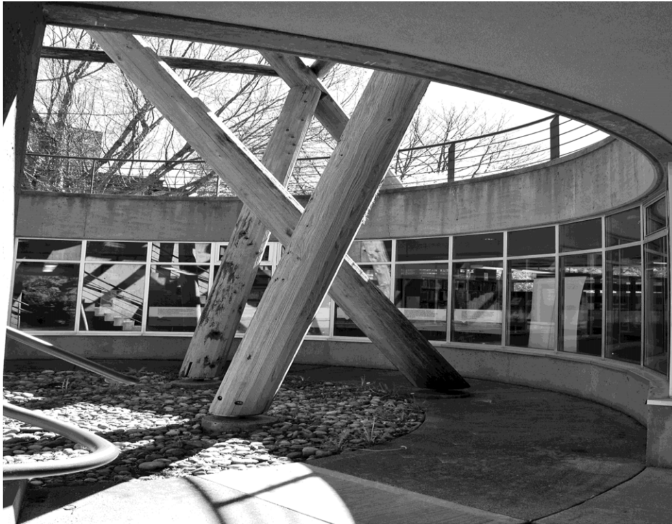
Fig. 3. Xwi7xwa Library.