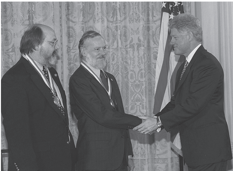
Ken Thompson (left) and Dennis Ritchie (center) receiving the National Medal of Technology from President Clinton in 1999.

ICGA Journal readers who are interested in information on our publications are referred to our website. A complete list of all articles, notes, and literature reviews published in the ICCA Journal and the ICGA Journal is accessible on the Internet at http://www.icga.org