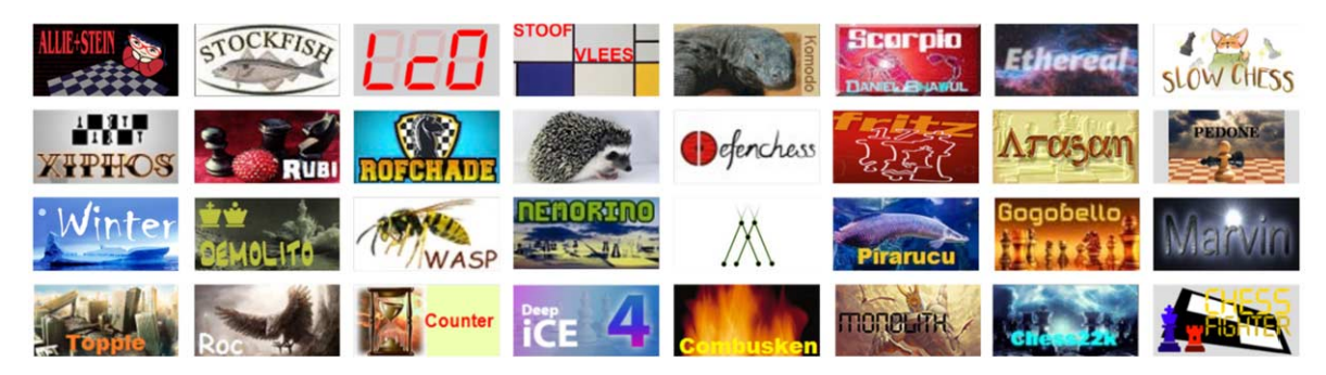
Fig. 1. The TCEC Cup 7 engines (CPW, 2020) in seed order (ALLIESTEIN \rightarrow STOCKFISH \rightarrow \cdots \rightarrow CHESSFIGHTER).

Second author Nelson allocated openings of 4, 8, 12 and 16 ply to the first four rounds: Jeroen Noomen's openings for the finals came from his Superfinal books for TCEC seasons 9-19. Both chose randomly with some regard for frequency over the board providing the usual variety of play.