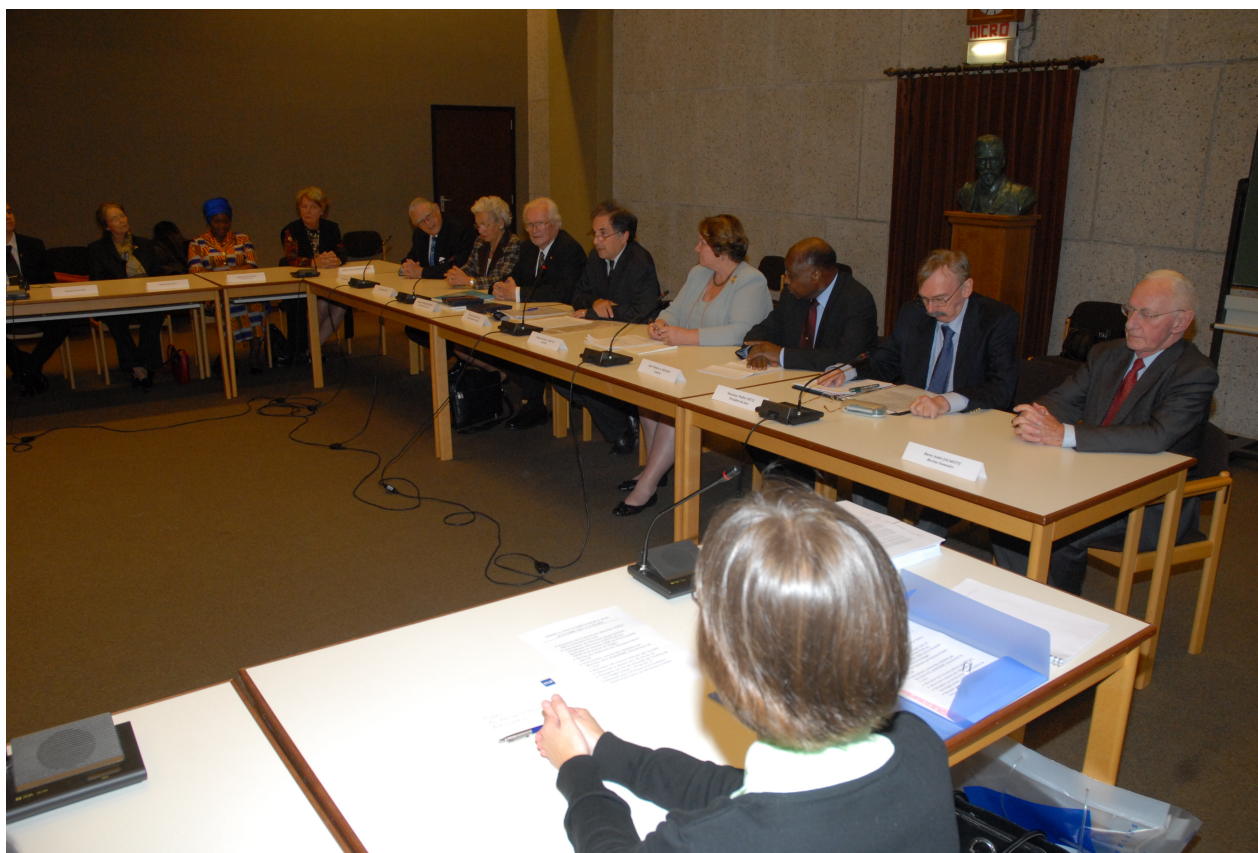
The representative of the Rector speaking

A second limitation to a rights-based approach to environmental protection is found in the limited remedial mandates of human rights bodies. The European Court can award monetary damages, but has no power to order injunctive relief or mandate specific action. Thus, rights may be vindicated with money for the applicants to move away from the environmental harm, but it is not clear that the environmental conditions themselves are improved. Fadayeva v. Russia 59 is a case in point; the applicant was awarded compensation, but the polluting industrial facility remained in operation as before. A further limitation is that the decisions of the Inter-American Commission, the African Commission, and the UN bodies are recommen-