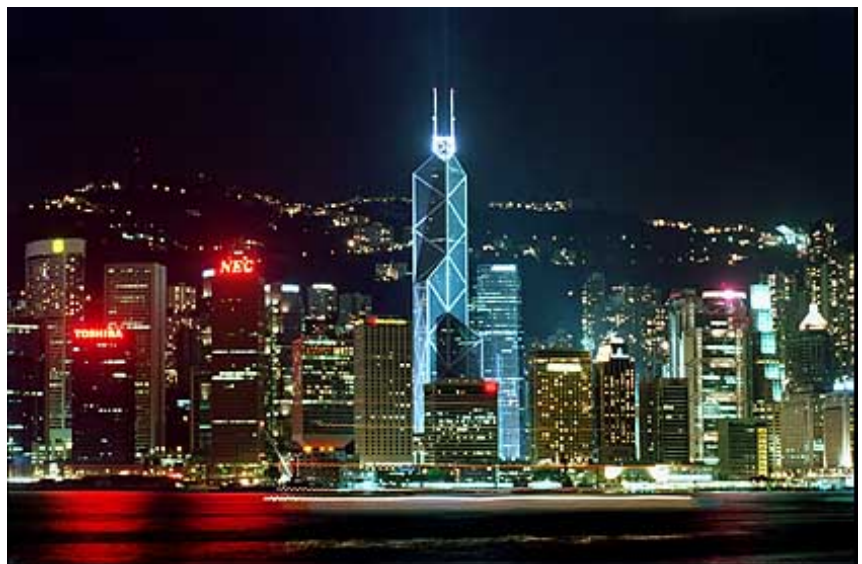
Financial centre Hong Kong

Benefits for employment, although highlighted by the German case, were also notable in the results of the COMETR project (which revealed positive or neutral employment effects connected to ETR). 9 Analyses of the potential employment effects of ETR in Hungary and Estonia revealed in the former that a 1% reduction in labour