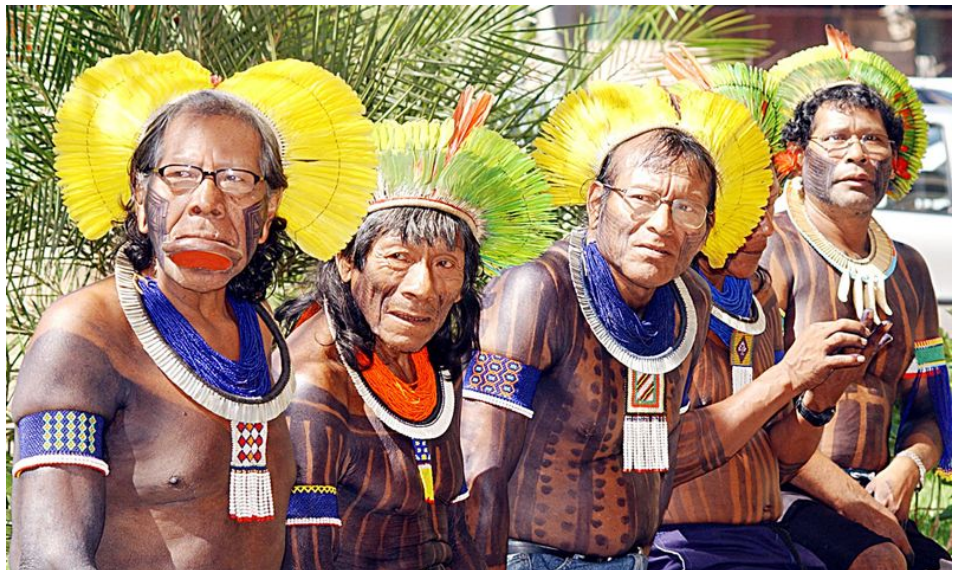
Brazilian Indigenous chiefs of the Kayapo tribe

Where wrong decisions were the result of misaligned incentives rather than mistakes, the incentives have to be changed. While in principle, incentives can be changed both by penalties and rewards, in the case of decisions appertaining to resource revenues the key changes are likely to come from new penalties. This is because the private rewards for socially costly decisions are usually too high to be countered by even higher rewards for good