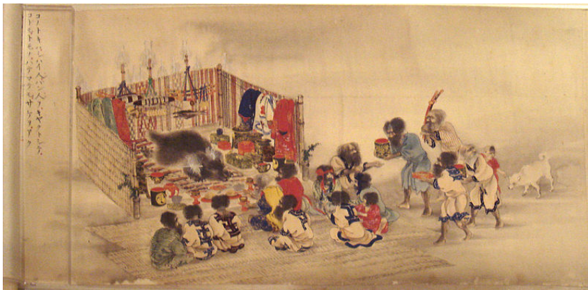
Ainu bear sacrifice. Japanese painting 1870

If these codes are to be promulgated some entity needs to be responsible for them. The precedents for the promulgation of voluntary codes suggest that various approaches can be effective. Many codes of economic behaviour have been promulgated by the IMF and are part of its