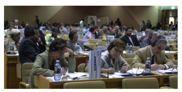
Committee of the Whole drafting

UNEP's work, and highlighted the need to enhance the scientific basis thereof. The plenary was then opened for statements by State Delegates and representatives of inter- and non-governmental fora. As per the agenda, the discussion turned to the outcomes of the WSSD and linkages among environment-related conventions, with a particular focus on chemicals, trade and water issues. A number of delegates also commented positively on the