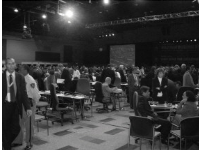
During a break in plenary proceedings

15. We risk the entrenchment of these global disparities and unless we act in a manner that fundamentally changes their lives, the poor of the world may lose confidence in their representatives and the democratic systems to which we remain committed, seeing their representatives as nothing