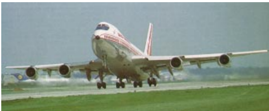
Preparing for take-off

The Convention also established the International Civil Aviation Organization (ICAO) which is required as one of its objectives to foster the planning and development