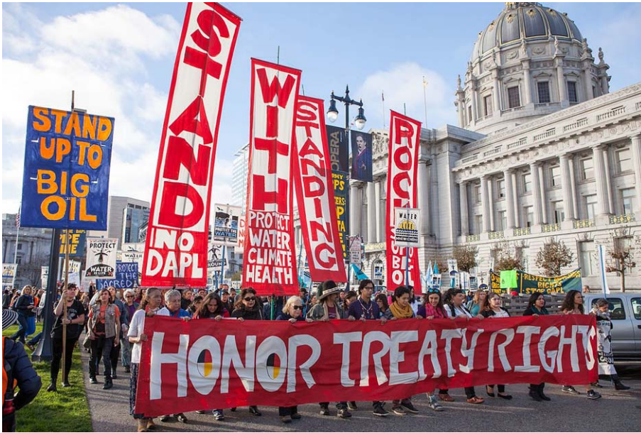
Fig. 3. Standing Rock solidarity march in San Francisco, November 2016.

these laws mandate harsh charges and penalties for exercising constitutional rights to freely assemble and to protest. 20