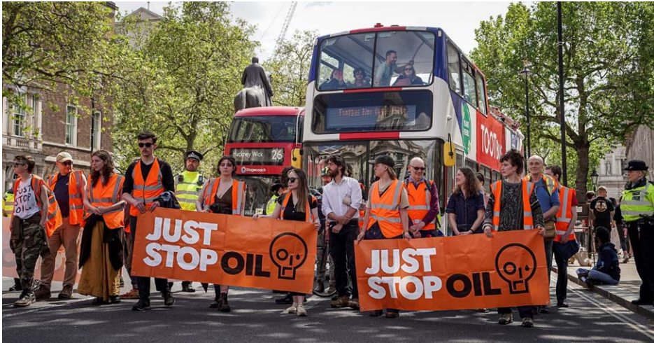
Fig. 4. Just Stop Oil activists walking up Whitehall towards Trafalgar Square on Saturday 20 May 2023.