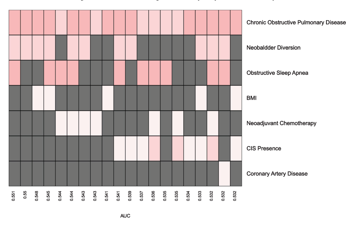
Fig. 2. Prediction Models for High Grade Post-Op Complications within 30 Days.

Fig. 1. Prediction Models for High Grade Post-Op Complications within 90 Days.