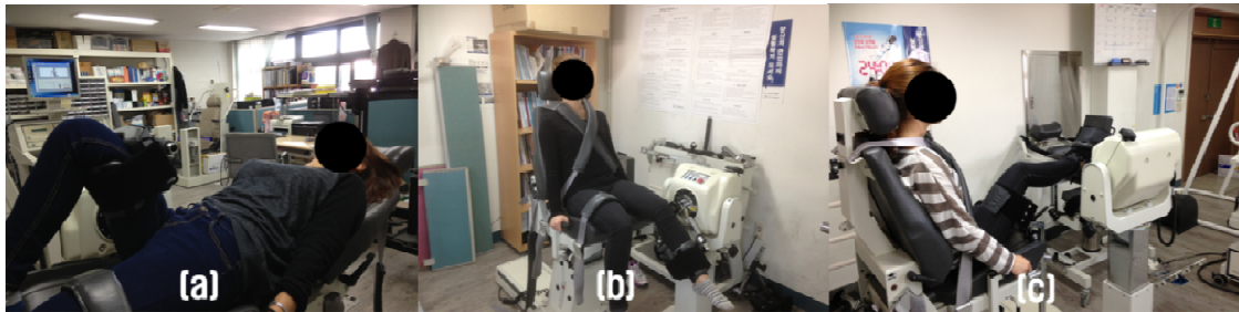
Fig. 2. Isokinetic joint torque test for estimating correction effect of muscle imbalance in lower limbs ((a) hip joint, (b) knee joint, (c) ankle joint).