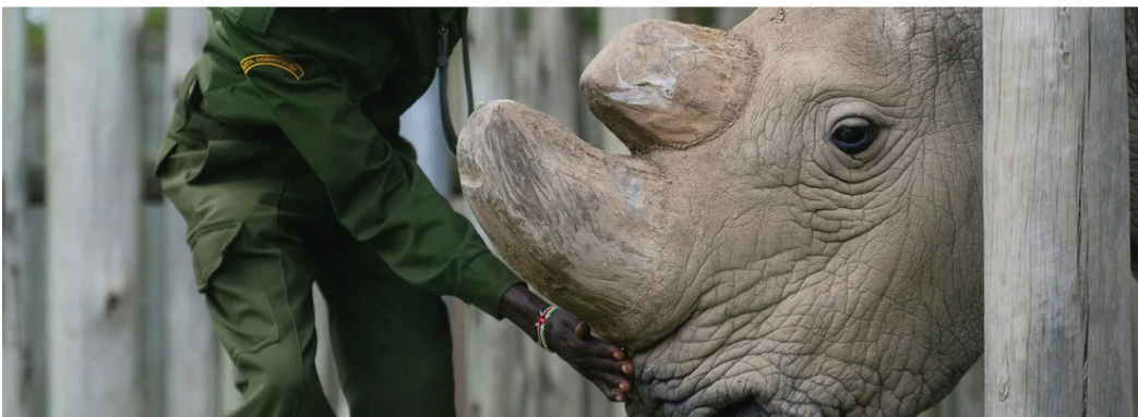
Sudan, the world's last male northern white rhino, died in 2018. In his final years, he became a global celebrity and conservation icon, helping raise awareness about the brutality of poaching.