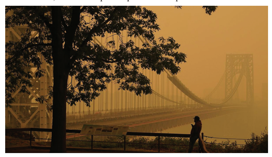
(File photo)